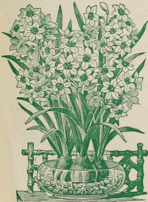
Chinese Sacred Lily.

Price, each, 15c; 2 for 25c; per doz., $1.40. Extra large bulbs, each, 20c; 3 for 50c; per doz., $2.00.